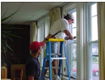
New modern windows give assurance of a more comfortable convent meeting space for parishioners this winter.