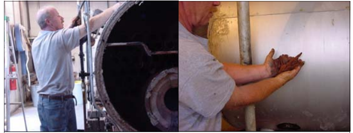
Pictured here is Ed cleaning Trinity's boiler. Cleaning and inspecting boilers for rectory, church and school are a big part of Ed's summer chores.