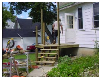
Reconstructed entry way to the meeting room will provide shelter from wintry winds.