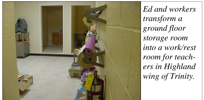
Ed and workers transform a ground floor storage room into a work/rest room for teachers in Highland wing of Trinity.