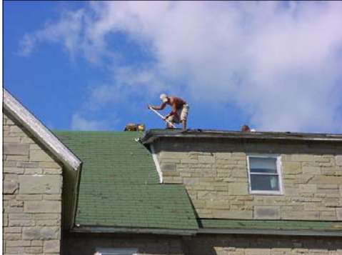
Brainard workers take advantage of dry sunny weather to pry off and replace the roof on front of the '50s wing. Rear roof was done several years ago.

Fr. Don's plans include renovations to the first floor of the convent known as the "convent meeting room". This north wing of the convent was added to the original house in the 1950's.