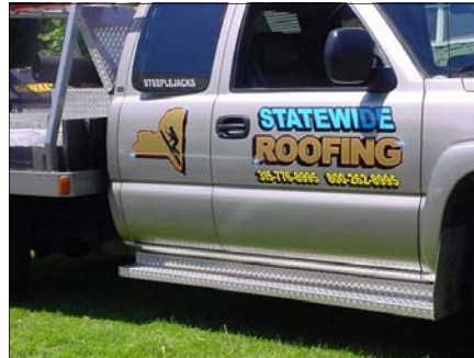
When you see this truck, look up!