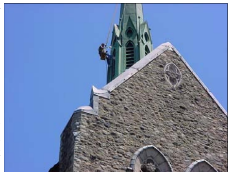
Hanging by a "thread", Randy and Jessie swing into position to replace worn copper sheath on tower steeple.

Donald noted that the copper sheathing on the steeple and other places on the roof can last 50 to 70 years before disintegrating. Acid rain and other elements in the air eat away at the copper. He checks the color. Copper-colored copper is new. Brown color tells the men that it is beginning to wear. When green it is thinning out, at its least protective stage, and needs replacing.