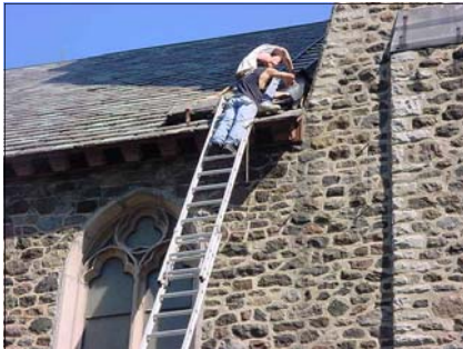
Two work at replacing copper seams, slate and ice/water barrier on north tower.

These buildings have been a part of our memories and hopefully our life routines. They are part of our spiritual heritage keeping us anchored in life giving values. It is the tangible symbol of the Faith anchoring our personal, family and community life.