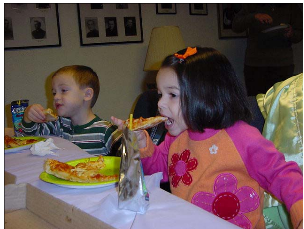
Tots having pizza during Play Group

Building an awareness of the inner sacred self & New ways to inspire, encourage, and affirm each other through all stages of life.