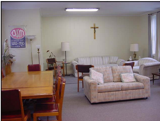
View toward back outside entrance