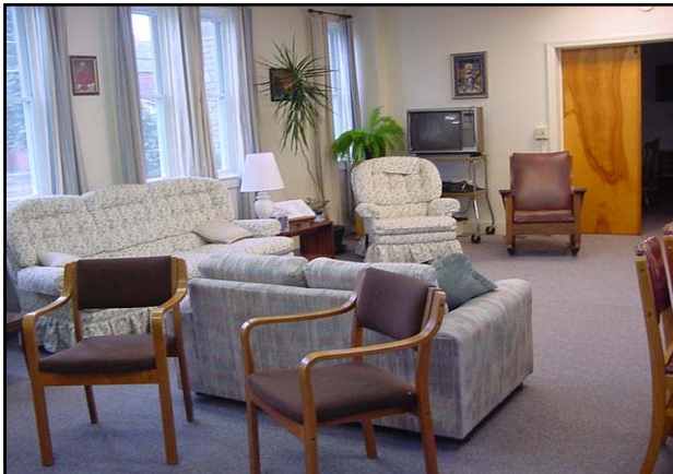
Looking toward double doors into convent