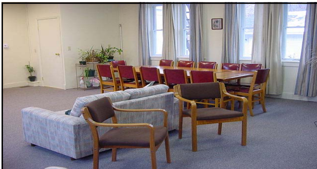
Table for meetings adds to usefulness.