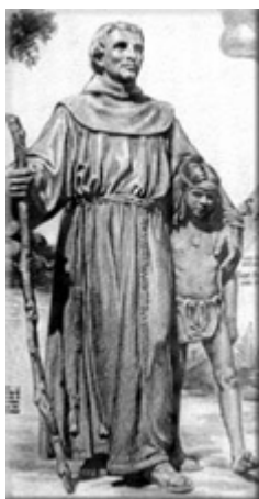
In His Steps

Serra Club of Bethlehem 872 Media St Bethlehem, PA 18017-6052