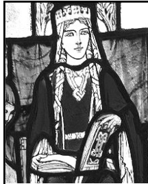
Image of St Margaret at St. Margaret's Chapel, Edinburgh