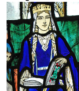
Image of Saint Margaret in a window at St Margaret's Chapel, Edinburgh

National Pilgrimage to Carfin in honour of St. Margaret of Scotland.