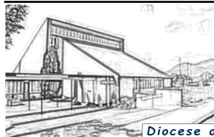
Diocese of Dunkeld Scottish Charity No. SC001810

22nd January 2017 + 3rd Sunday in Ordinary Time