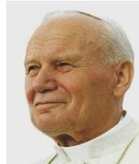
John Paul II

This morning at 10am in the Consistory Hall of the Apostolic Palace, the Holy Father presided over an ordinary public consistory for the canonization of the Blessed Popes John XXIII and John Paul II.