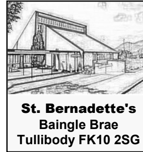
St. Bernadette's Baingle Brae Tullibody FK10 2SG

www.catholic-church.org/stbernadettes & www.catholic-church.org/stjohnvianneys