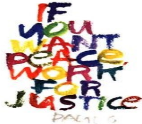
A Catholic Social Teaching message from Pope Paul VI : "If you want Peace, work for Justice."