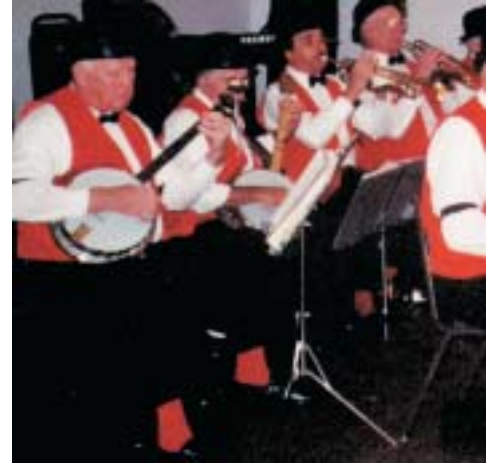
The Pittsburgh Banjo Club entertained the 200 guests.