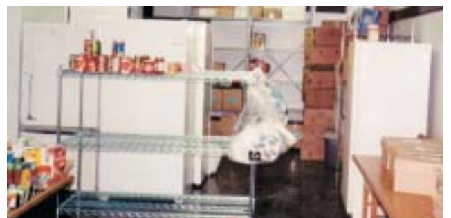
New shelving, refrigerators and freshly painted walls at St. Paul's Food Bank.

Recently we received a Grant from Pittsburgh's Birmingham Foundation to refurbish our Food Bank. The Birmingham Foundation funds projects which serve local Pittsburgh neighborhood needs. We were able to get new shelving, do wall and electrical repair, and even purchase two much needed refrigerators. We thank the Birmingham Foundation for helping us to continue our tradition of helping the needy in our midst.