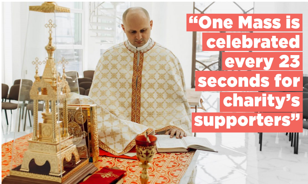
A Ukrainian Greek-Catholic priest in the Archeparchy of Ivano-Frankivsk celebrating the Divine Liturgy in an empty church because of the COVID-19 lockdown.

ACN: E-news SUPPORTING THE FAITHFUL WORLDWIDE