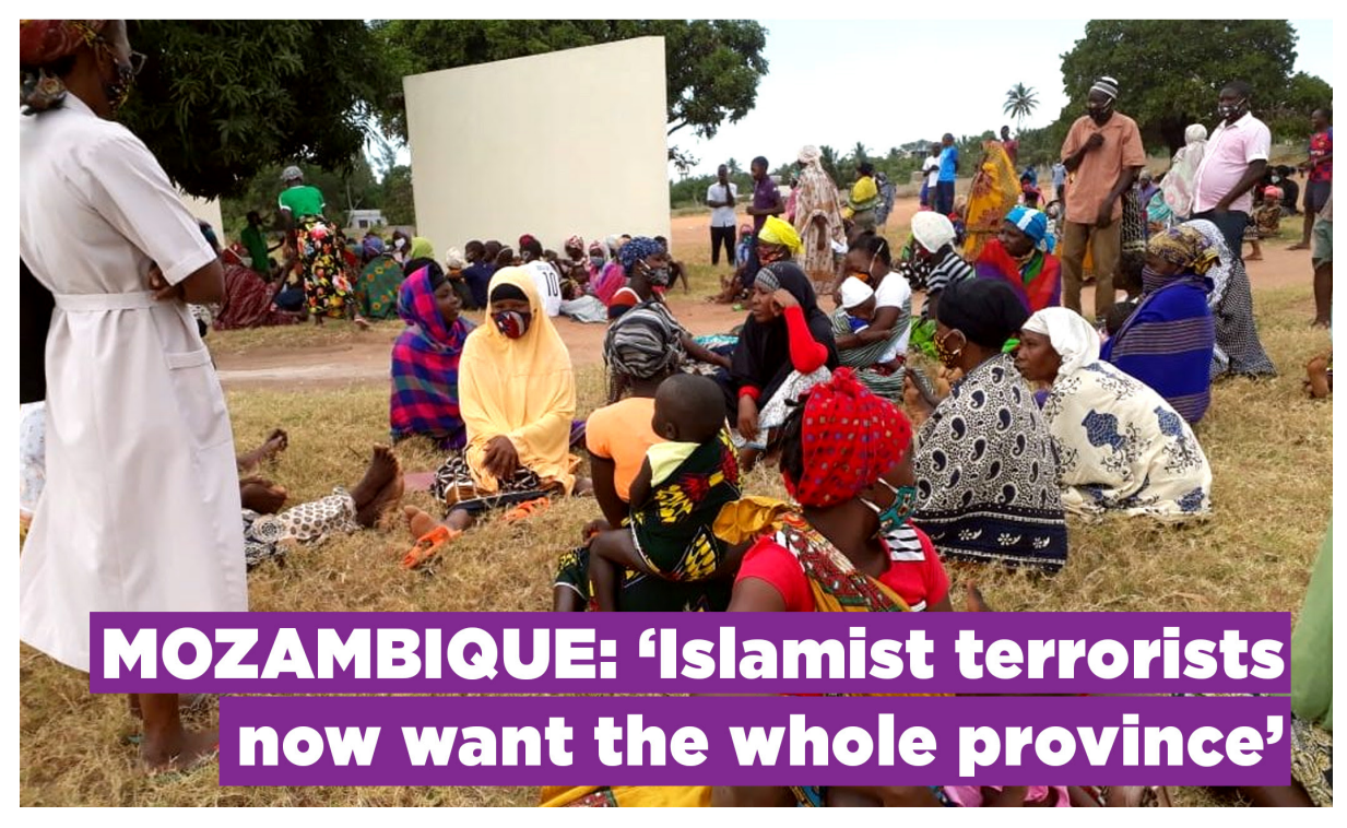
Families who fled Mocímboa da Praia, Cabo Delgado province, Mozambique after it was attacked by Al Sunnah wa Jama'ah on 26th June 2020.

Jihadists wreaking havoc in the north of Mozambique are determined to seize the whole of Cabo Delgado province, according to Church sources in the country.